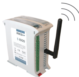
S1000 RTU with W-Z add-on

The Inico W-Z Wireless System, part of the Automation 2.0 generation.